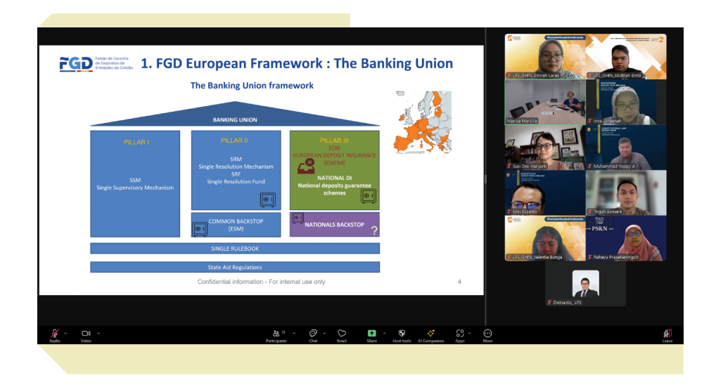
IDIC facilitated a virtual benchmarking session with FGD.

On 28 July 2024, IDIC facilitated a virtual benchmarking session with the Fondo de Garantía de Depósitos de Entidades de Crédito (FGD) of Spain. This session was organized to support the Research Centre for State Policy Studies (CIPF), a think tank from the Faculty of Law at Universitas Padjadjaran, in their ongoing research.