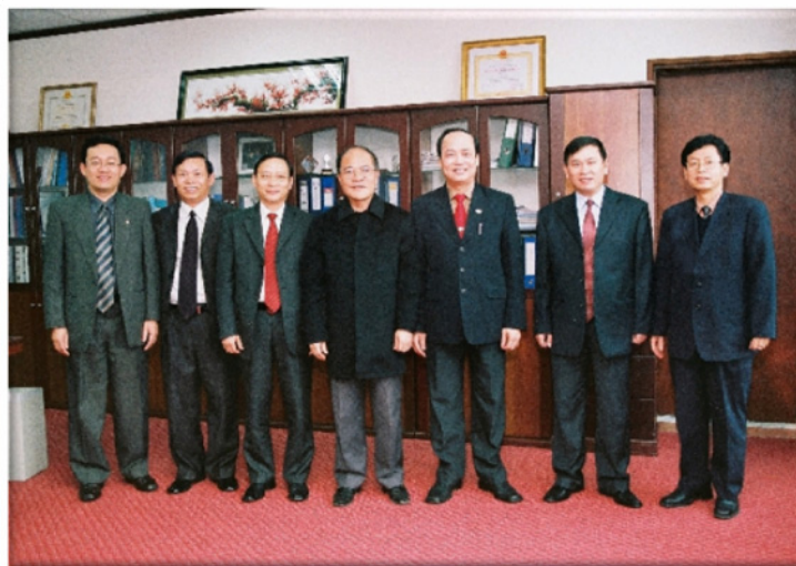
Chairman of the Board of Directors and Management Board of DIV and Mr. Nguyen Sinh Hung – First Vice Prime Minister at the Head- office of DIV