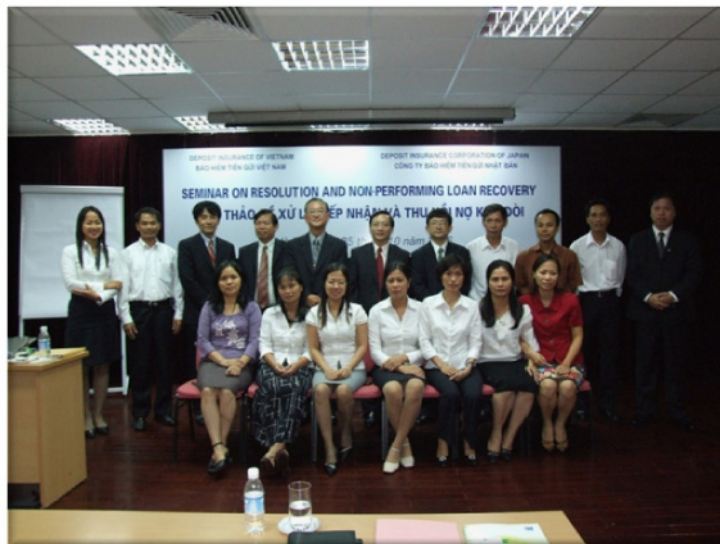
Seminar on Resolution and Non-Performing Loan Recovery Conducted by Experts from Deposit Insurance Corporation of Japan DIV, October 25, 2006

Deposit Insurance of Vietnam will establish a professional human resource that meet the criteria of business competence, professional ethics, flexibility, creativity and efficiency in a cooperative, fair, cautious, honest and corporate loyal manner.