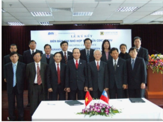
Group photo of representatives from DIV and CDIC.