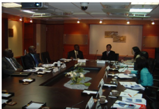
DPB (Zimbabwe) delegation and CDIC experts were enthusiastic about discussing questions.