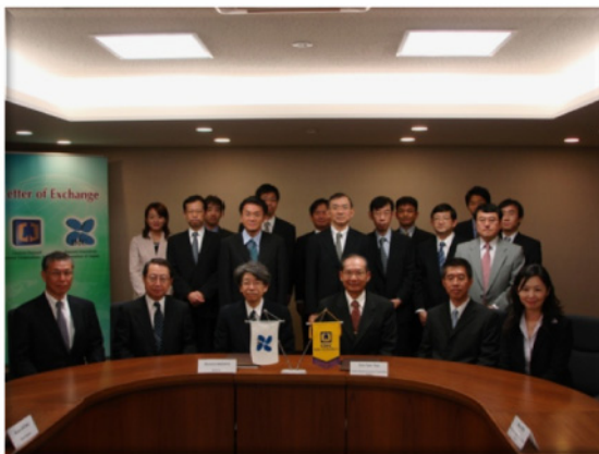
Group photo of top management from DICJ and CDIC.