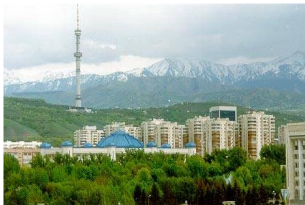
View of Almaty